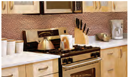
Liberty Collection copper sheets also create the appearance of optical flatness, since light patterns are broken up by the

As with all copper, the Revere Liberty Collection is lightweight and easy to work with. This versatile metal has many inherent advantages, including superior malleability and corrosion resistance. It's durable and attractive, too, and the new textures only enhance these qualities.